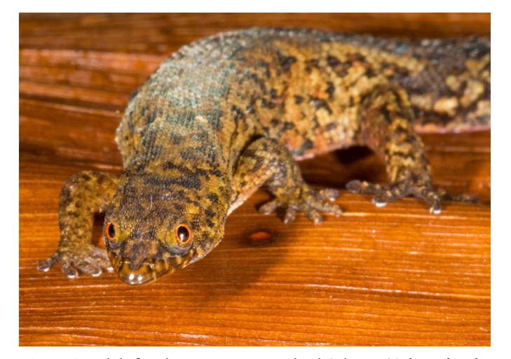
Fig. 1. An adult female Puerto Rican Upland Sphaero ( Sphaerodactylus cf. klauberi ) from the Guilarte State Forest.

The introduction of alien flora and fauna has been widely recognized as detrimental to native species (Clavero