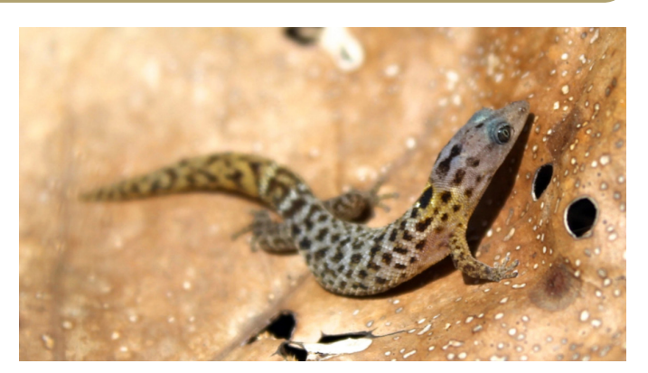
Fig. 2. An adult Inagua Sphaero ( Sphaerodactylus inaguae ) from Great Inagua Island, Bahamas.

and García-Berthou 2005; Short and Petren 2011). However, introduced species can have neutral or positive interactions with native species (Schlaepfer et al. 2010; Kuebbing and Nuñez 2015), and such counterexamples include the use of nonnative flora as nesting substrate (Smith and Finch 2014). We herein report on the use of non-native trees for communal nesting by two Caribbean dwarf geckos, the Puerto Rican Upland Sphaero ( S. cf. klauberi ; the taxonomy of the S. klauberi group is undergoing revision; Fig. 1) and the Inagua Sphaero ( S. inaguae ; Fig. 2) on Puerto Rico and Great Inagua Island, Bahamas, respectively.