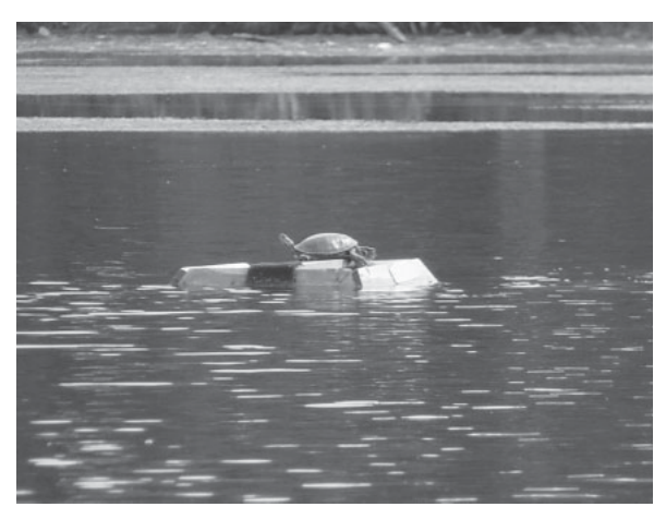
Basking adult painted turtle about to be captured in one of our basking traps on Stump Lake, Stearns County, Minnesota.

While the total number of harvested turtles reported each year to the Minnesota DNR varied substantially, the mean number of turtles captured per harvester did not. The reasons for this apparent discrepancy were yearly fluctuations in number of harvesters filing permit returns and dramatic catch increases in 1994 and 1998. Catch increases in these 2 years primarily were due to the activities of 2 harvesters catching 17,883 and 28,000 turtles, respectively, in 1998 and 1 harvester who captured 35,000 turtles in 1994. Seventy-five percent of all harvesters reported catching <1,200 turtles per year, indicating that most of the harvest was done at a relatively small scale. Any inferences taken from these numbers should be viewed cautiously; there was evidence that some harvesters underreported their catch and not all harvesters filed yearly returns (J. Moriarty, Ramsey County Parks, personal communication).