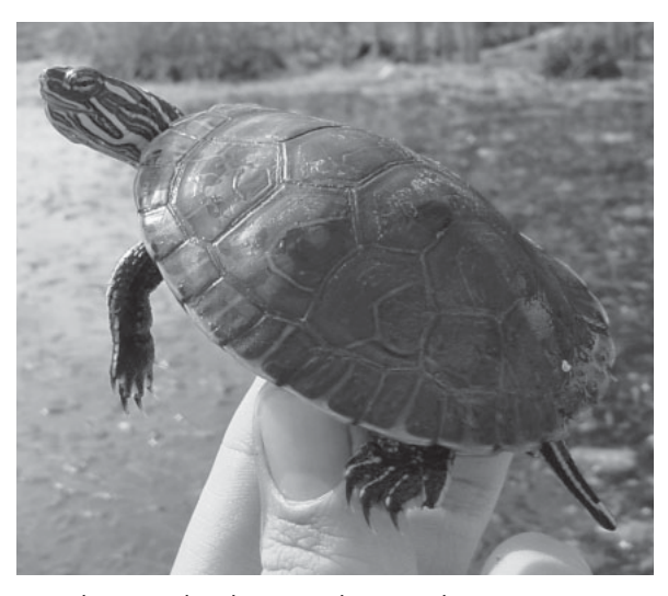
Juvenile painted turtle captured in central Minnesota in 2002. Small size and attractive coloration make painted turtles desireable pets.

Most long-term studies of painted turtle populations exhibit a 1:1 sex ratio (Ernst et al. 1994). When painted turtle sex ratios were not equal, they tended to be skewed in favor of males. The primary reason for this disparity is that males mature faster than females and therefore enter the adult cohort sooner (Gibbons 1990). Gibbons (1990) lists several other factors that can influence the perceived or actual sex ratios in turtle populations, the most relevant to this study being the sample bias associated with trapping methods. Both basking traps and hoop traps tend to catch more males because male turtles are attracted to traps already containing females (Cagle and Cheney 1950, Vogt 1979, Frazer et al. 1990). It is conceivable that male-biased commercial trapping could result in populations with seriously skewed sex ratios. We found no correlations between the count of male:female:juvenile turtles and harvest status, suggesting that harvesters, using male-biased trapping methods, have no noticeable effect on sex ratio. Another possible explanation is that revealing differences in sex ratio among lakes of different harvest status is difficult to do using malebiased methods. Multiple capture methods, including non-male-biased methods such as hand-capture (Ream and Ream 1966), should be used in future assessments of harvested turtle populations to determine whether sex ratio is indeed biased.