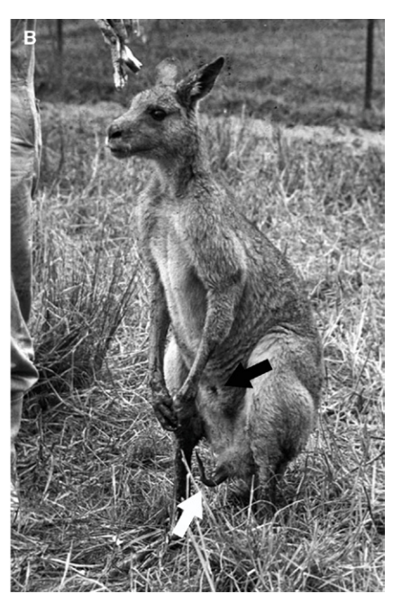
Figure 3. Animals of mixed-sex genotypes showing both male and female sexual traits. (A) Bilateral gynandromorph chicken. Right side has cells that are predominantly ZW, while left side cells are predominantly ZZ. Consequently, female characteristics, e.g. small wattle and small leg spur, are expressed on the bird's right side (brown plumage) while male characteristics, e.g. large wattle, large leg spur and greater muscle mass, are expressed on the bird's left side (gold and white plumage). (B) "Vincent", an XXY gray kangaroo ( Macropus giganteus ) showing both male and female characteristics. The black arrow indicates the pouch, which is determined by the number of X chromosomes, while the white arrow indicates the penis, which along with the testes is determined by the presence of a Y chromosome.

during evolution, with a fluidity that is possible because the only essential function of a sex determination switch is to make different individuals develop as different sexes. Phylogenetic studies suggest that the downstream 'business' end of a sex-determination pathway does tend to be more stable than the triggering mechanism at the top; in insects for example, tra and dsx play widely conserved roles in sex determination while SxI does not.